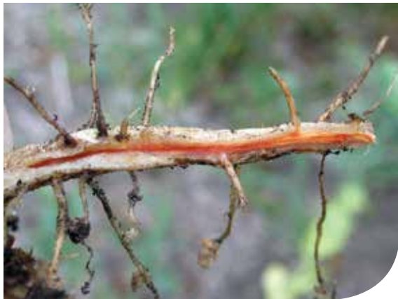
Red discolouration from Fusarium root rot

Fusarium species isolated from pulses in the Prairies include F. avenaceum , F. solani , F. redolens , F. oxysporum , F. graminearum , F. equiseti , F. culmorum , and F. poae . These pathogens are also able to infect cereals and other rotational crops.