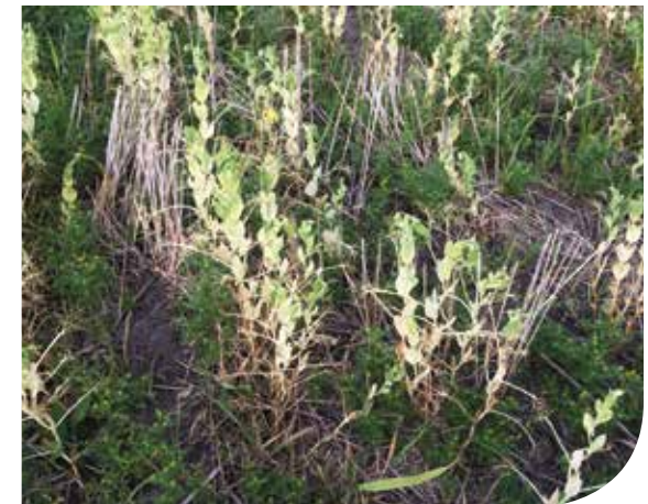
Peas damaged by Aphanomyces