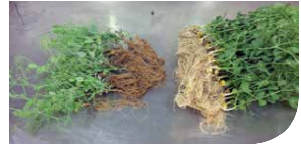
Caramel coloured roots are a key symptom of Aphanomyces root rot L: diseased plants, R: healthy plants

Pythium and Aphanomyces are organisms that belong to a group of fungus-like root pathogens commonly referred to as "water moulds." As the name indicates, they are particularly adapted to wet, waterlogged soils. Pythium can be controlled with certain seed treatments, and there is one seed treatment registered for early-season suppression of Aphanomyces (Intego™ Solo, currently only registered for use on lentils). Because Aphanomyces can infect at any time in the growing season and spores can persist for many years in the soil, Aphanomyces is the most difficult to manage, and therefore the most serious pathogen among the root rot pathogens.