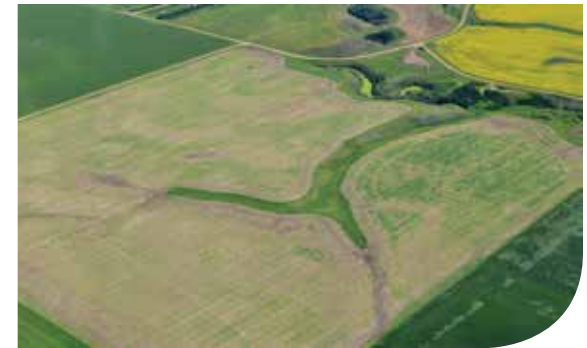
Aerial shows entire pea field in Alberta affected by root rot