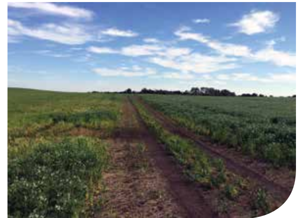
Root rot identified in left field in 2014. Field on the left had peas in 2010. The field on the right had canola in 2010, with no peas for previous eight years

The root rot pathogen can infect various crops in the rotation, or survive as a saprophyte (feeding on dead plant material) until the next susceptible crop is grown, and/or conditions are favourable for disease.