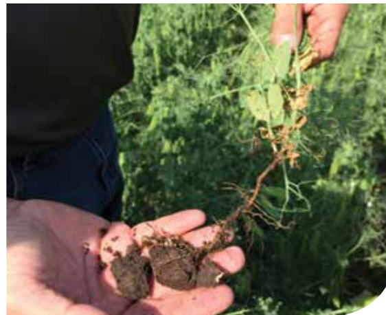
Browning of belowground portion of pea plants