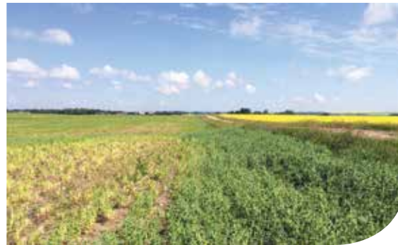
Better peas along field edge where grass helps reduce excess water