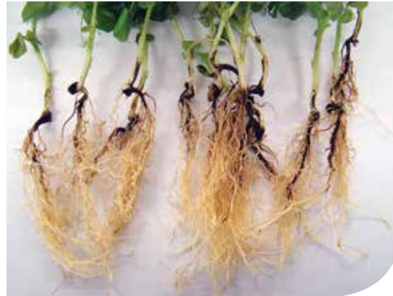
Blackened roots as a result of Fusarium root rot