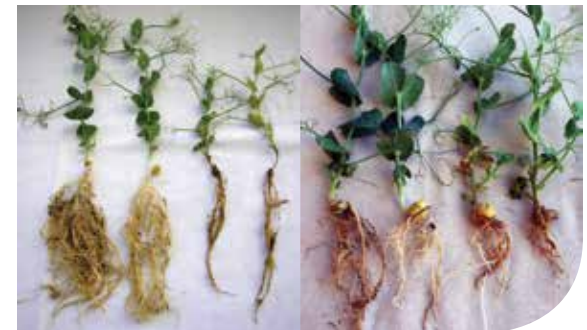
L: Seedlings grown in normally watered field soil. The two plants on the left do not have Aphanomyces present. The two plants on the right do have Aphanomyces present R: Seedlings grown in field soil where Aphanomyces is present. The two left plants were in normally watered soil. The two plants on the right were in flooded soil. Even when watered normally, Aphanomyces was able to cause disease in peas, but symptoms were more severe when the soil was flooded